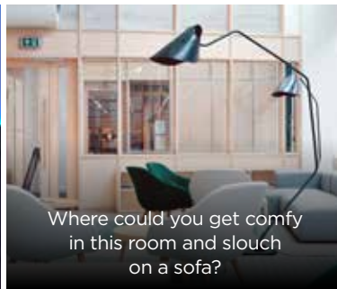
Where could you get comfy in this room and slouch on a sofa?