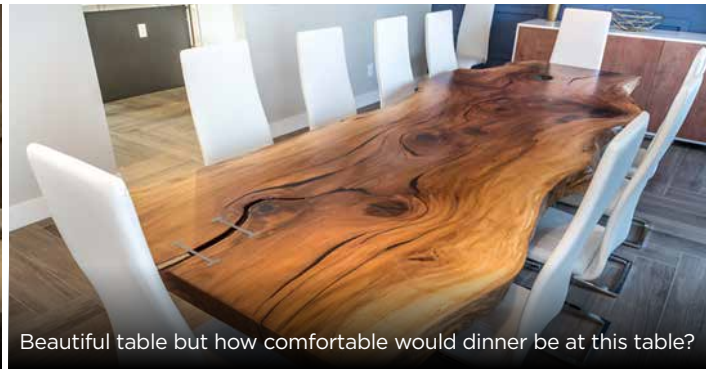
Beautiful table but how comfortable would dinner be at this table?