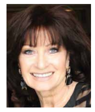
I love the start of a New Year, it's a time for reflection and a time for planning.

Every year a few friends and I get together and write our hopes and aspirations and intentions for the