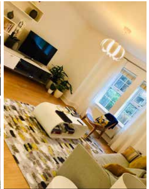
Modern retro style refurbishment designed to suit the personality of the owner.