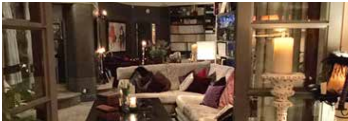
Designed for a client who puts comfort and storage high on the essentials list!