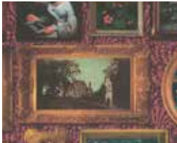
For the brave with personality a wallcovering from the Graduate Collection supporting emerging talent